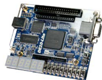
Figure 1. DE10 Lite Development Board